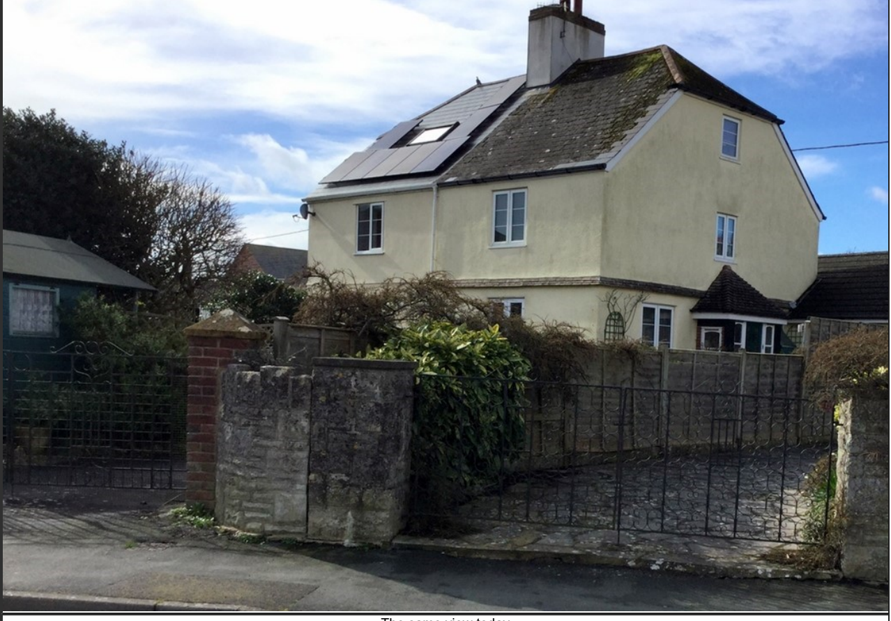
The same view today